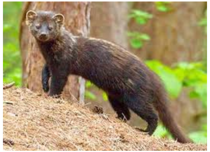
Most of us have chosen to live here and thus share these rolling wooded hills and ponds with the local wildlife. I love all of these creatures, even the coyotes. But what's the story on fisher cats ? I've never seen a live one, but I've heard the stories. Perhaps one night you heard an un-

earthly scream emanating from deep within the woods. Or maybe a neighbor has shared a frightening story of an uber-viscous tree dweller taking her cat one night. What exactly are these night hunters, and are they dangerous?